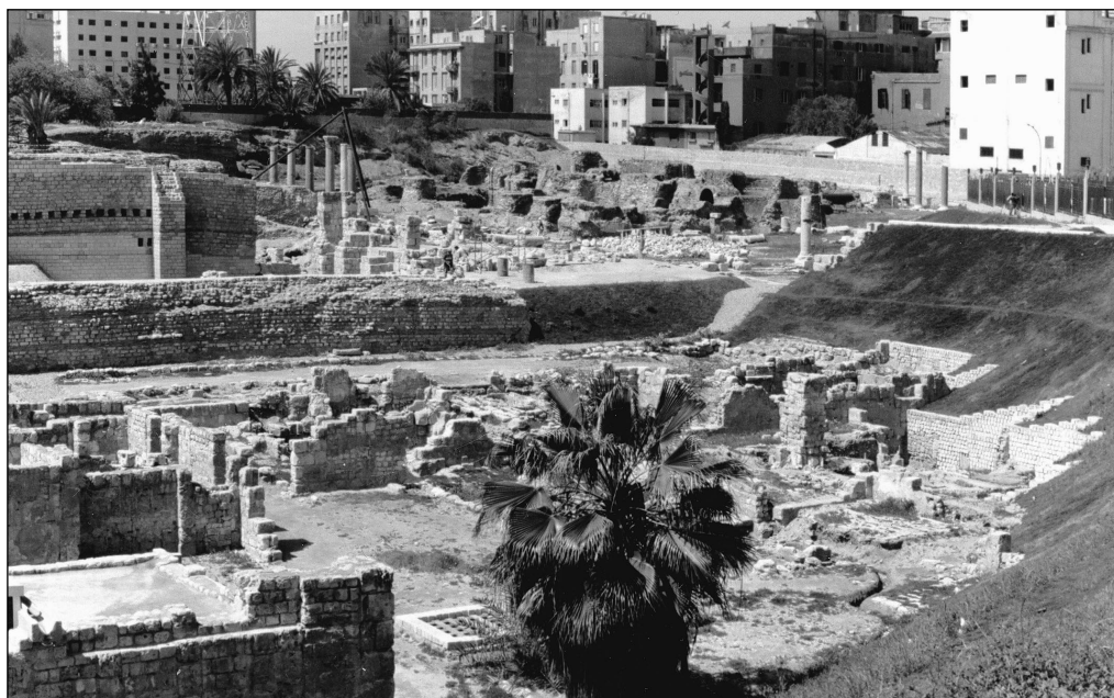
Fig. 2. Slope along the eastern border of the area