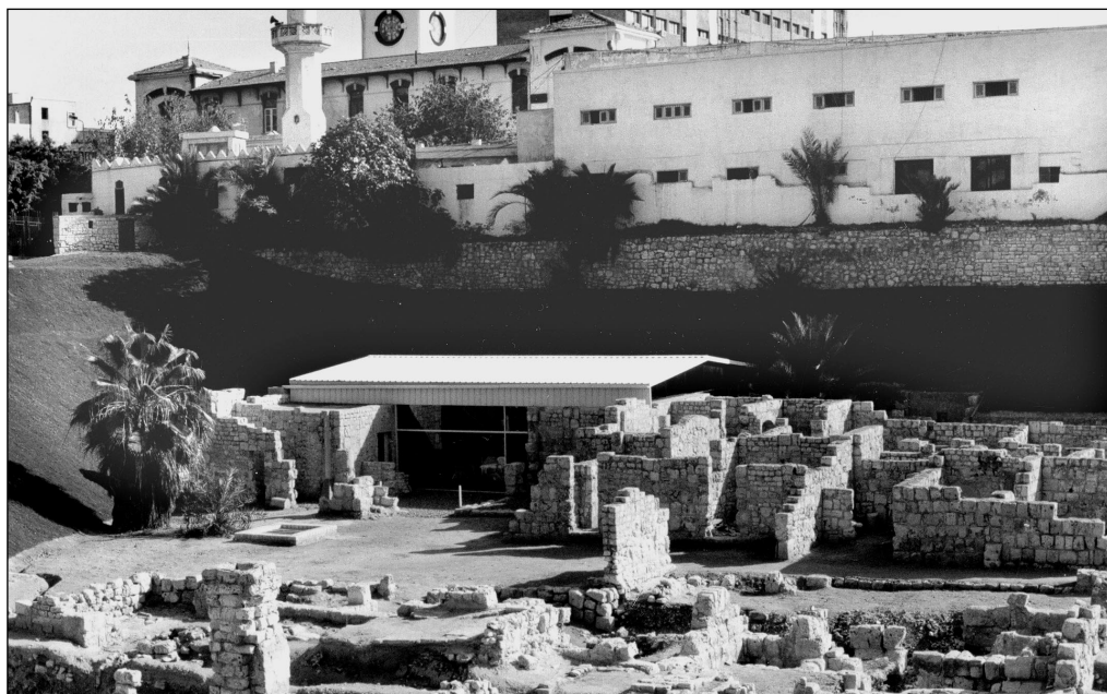
Fig. 1. Slope along the southern border of the area