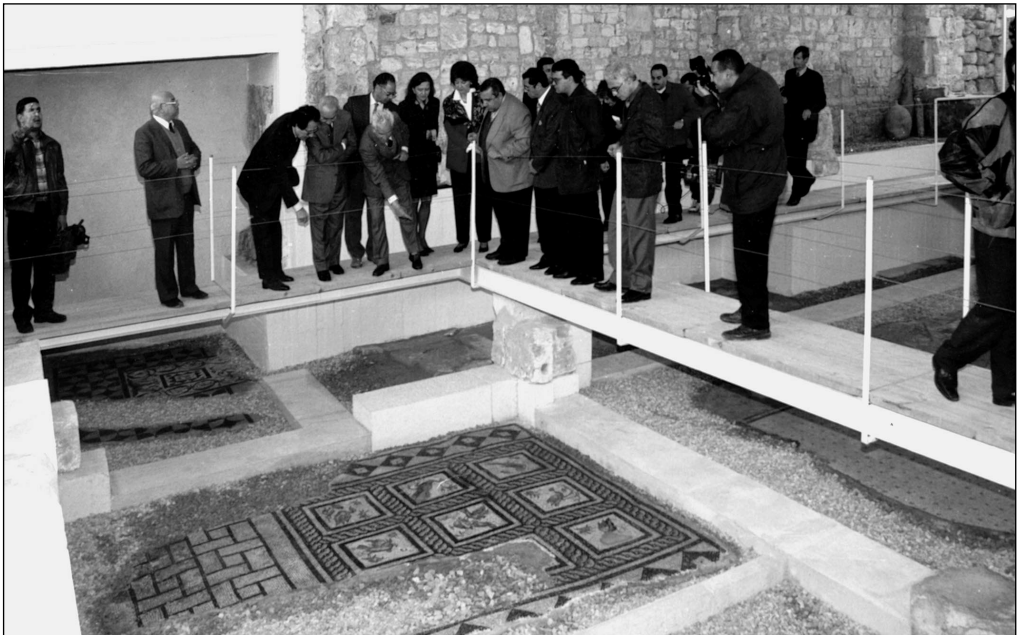
Fig 3. Official opening of the shelter over the mosaics in the "Villa of the Birds"