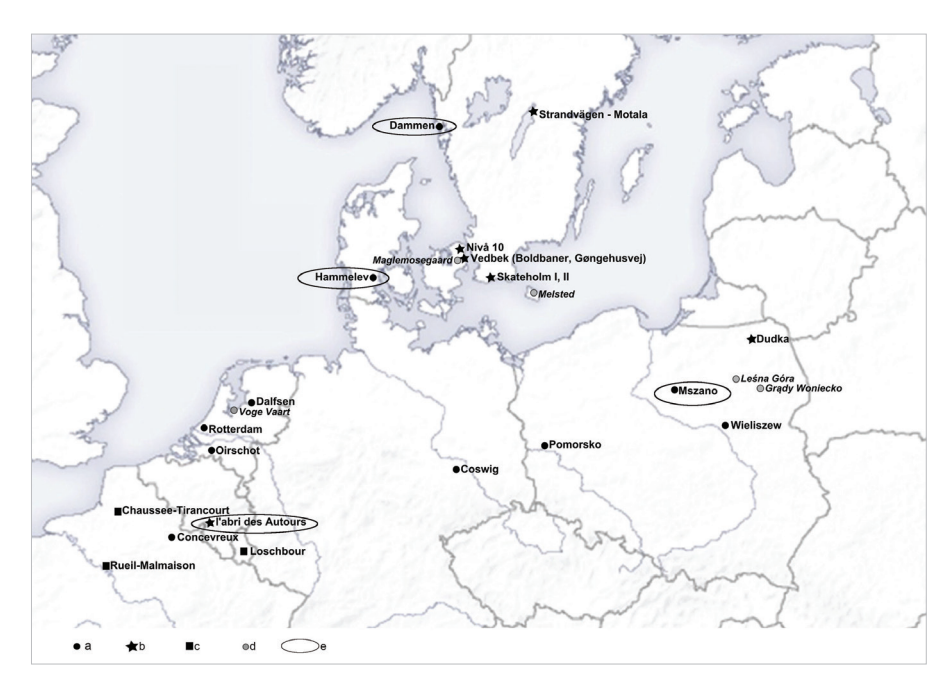
Fig. 1. Sites with Mesolithic and para-Neolithic cremation burials: a – cremation burials only; b – contemporary cremation and inhumation burials; c – noncontemporary cremation and inhumation burials; d – sites with loose burned human bones mentioned in the text; e – Early Mesolithic cremation burials (compiled by K. Bugajska).

Taking into account the uneven distribution of cremation burials, each region will be discussed separately in order to study the local character of the ritual. According to the original publications, the graves are linked to the Early, Middle or Late Mesolithic, based mostly on radiocarbon dates or, alternatively, on grave goods. It should be noted, however, that there are differences in the chronological periodisation of the Mesolithic in particular regions. In the Western European Plain (Low Countries, north-eastern France), the Early Mesolithic corresponds to the Pre-Boreal period (10 000–9000 BP conv.), the Middle Mesolithic - to the Boreal period and the beginning of the early Atlantic period (9000-7500 BP), while the Late Mesolithic starts in the Early Atlantic period (75000 BP).<sup>5</sup> In southern Scandinavia, the Early Mesolithic (Maglemose culture) corresponds to the Pre-Boreal and Boreal periods (10 000-8000 BP), the Middle Mesolithic (Kongemose culture) to the first half of the Atlantic period (8000-6500 BP), and the Late Mesolithic (Ertebølle culture) to the second half of the Atlantic period (6500-5200 BP).6 Some cremations or loose burned human bones are linked to the para-Neolithic, i.e. to pottery-producing hunter-gatherer societies, which appeared in the discussed regions between 6000 and 5600 BP conv.7