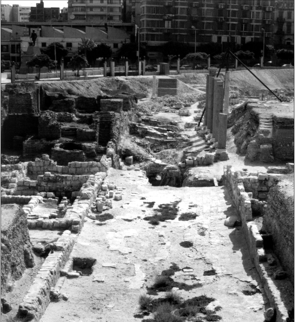
Fig. 4. Southern passage of the baths

which will constitute the main tourist path of the Archaeological Park to be created soon at the site ( Fig. 4 ). A section of the foundation wall of the main bath entrance