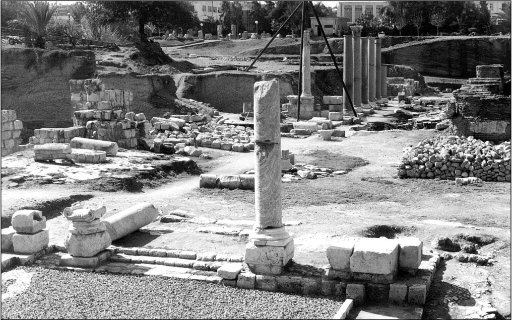
Fig. 5. Eastern edge (entrance) to the southern passage of the baths