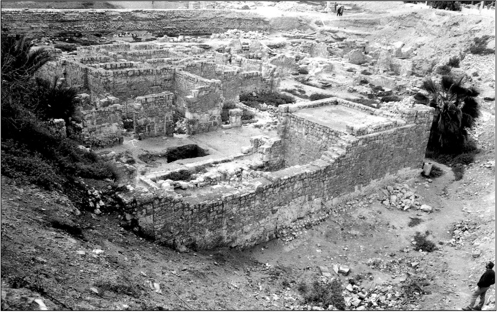
Fig. 1. Roman residential quarter. Site of the mosaics before the construction of the shelter