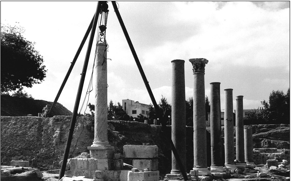
Fig. 6. Anastylosis of a marble column from the southern gymnasium