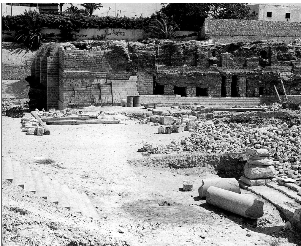
Fig. 7. Cistern. The northern facade during reconstruction works

(c. 18 m 2 ). Serious delays in the supply of building materials precluded the completion of some of these operations ( Fig. 7 ). A long-term operation for removing c. 15,000 m 3 of earth and debris overlying the Theater Portico has left the area open to archaeological excavations, which have begun in the southern end. The discovery of yet another fallen column of the portico prompted the decision to execute new bases for the columns with a view to completing the planned reconstruction. In preparation for the anastylosis of the Portico in the next season, two bases were cut of Helwan limestone.